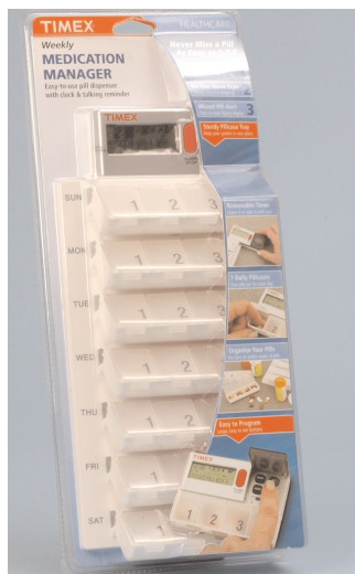
Timex Weekly Medication Manager

That brings us to the Timex Weekly Medication Manager . The Timex system is great because it has four different medication compartments at each level and seven levels, thus giving you enough compartments for four different sets of medications every day for seven days. The system also has alarms on it so you can get friendly reminders of when you need to take your medications. The alarm can be a beep, a voice, or a flashing reminder. Each compartment can have its own reminder. The box can also have two additional timers set. The system has a history tracker so that you can see when the alarms were stopped and when pills were missed. One very big bonus of this unit is that each individual four-compartment tray can be taken off of the