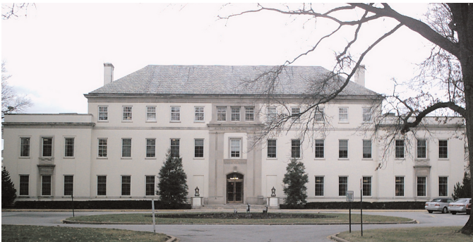
The New Castle County ATRC recently moved to the second floor of the Administration & Research Building of the Alfred I. duPont Hospital for Children.

The New Castle County Assistive Technology Resource Center (ATRC) has moved to the Alfred I. duPont Hospital for Children in Wilmington. With its new office space in North Wilmington, the ATRC will continue to serve as the comprehensive AT resource center in New Castle County.