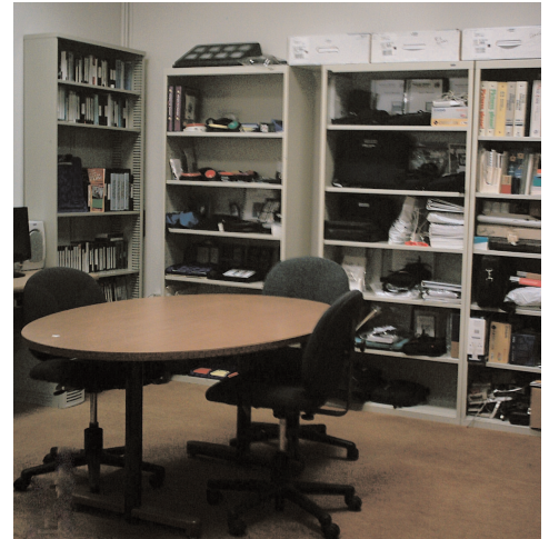
The new ATRC provides more space for housing AT items available for demonstration and loan.

Services offered at the site include personal equipment demonstration, assistance in helping to identify technology options for a given need, and consultation relative to funding options. Most