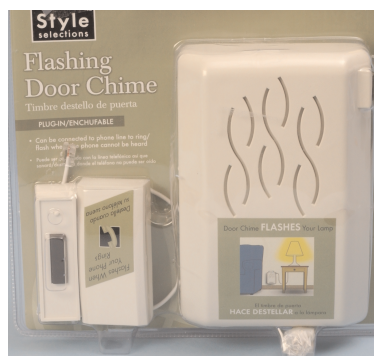
Flashing Door Chime

The Flashing Door Chime works along similar lines, but is for use with doorbells and phones. To use this unit, simply mount the doorbell chime button where you would have a regular wired doorbell button. The receiver is plugged into the wall and a lamp is plugged into it. When the button is pressed, the light plugged into the receiver will flash, giving a visual cue that the doorbell has been pressed. It also has a chime on it with a few