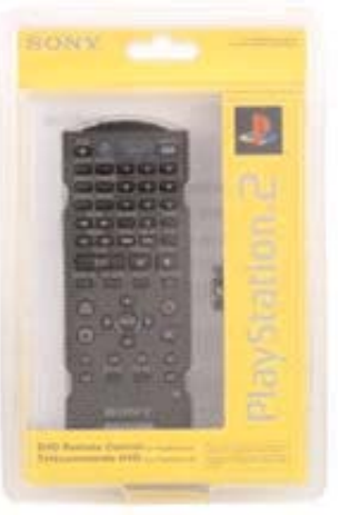
PlayStation 2 controller continued on page 5

My next bargain is actually a tip I received from an AAC discussion group, and it's pretty neat! If you are an individual who uses an AAC device with an infrared (IR) output so that you can control a