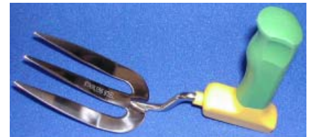
The easi-grip fork is available at your local ATRC. Come try it out.

“Proper” Garden Tools make tasks easier for all gardeners. Long-handled and lightweight tools reduce back stress and enable you to work longer.