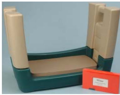
This garden kneeler/bench is available at your local ATRC.

Knee Pads that attach to long pants can be made from two 5" by 5" pads of 1½" thick foam. Sew a heavy duty, durable fabric around the foam like a pillowcase, attach Velcro to each pad and your pants, then attach pads when needed.